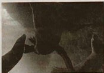
Karen Glaser "Adolescents Pooling" 2002 29" x 38", Selenium-Toned Silver Gelatin Photograph, KGL6