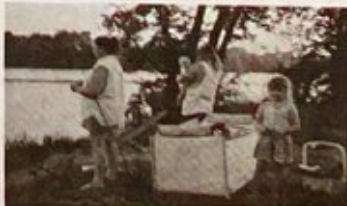
Allan Sekula, Prayer for the Americans(1), 1999-2004