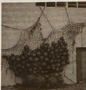
Sylvia Riquezes "The Blob"

Through December 30, 2004. Damien B. Contemporary Art Center, 282 NW 36th Street Miami.