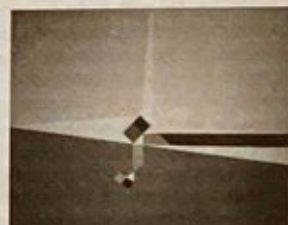
Tomas Maldonado "Desde un Sector" 1922